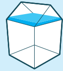
Cold roof - ceiling level